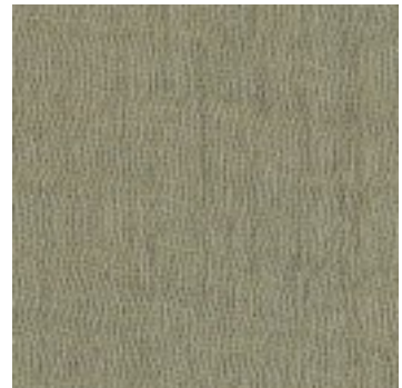
09959.041 MOSS GREEN