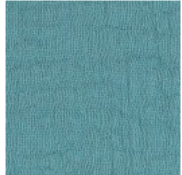
09959.038 BLUE SHADOW