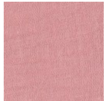
09959.007 OLD ROSE