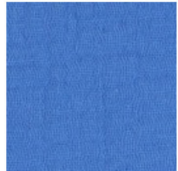
09959.077 ROYAL BLUE