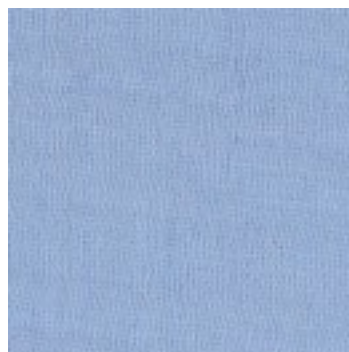
09959.055 LIGHT BLUE