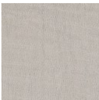
09959.045 LIGHT SAND