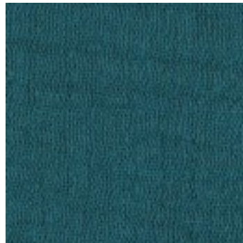
09959.052 DARK CYAN