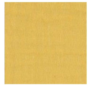
09959.026 SOFT YELLOW