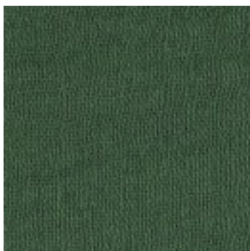
09959.042 DARK GREEN