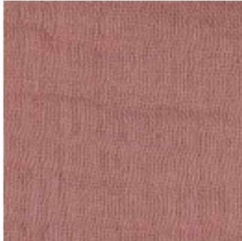
09959.048 OLD BLUSH