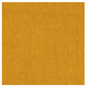
09959.023 DARK YELLOW