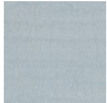
09959.053 BABY BLUE