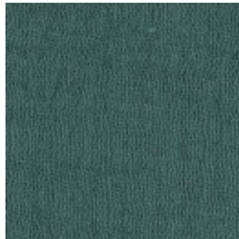
09959.040 OLD GREEN