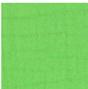
09959.069 LIME NEON