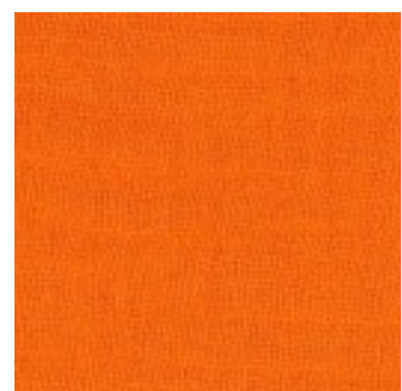
09959.071 ORANGE NEON