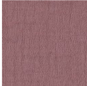
09959.049 LIGHT LILAC