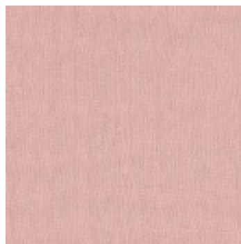
09959.021 LIGHT ROSE