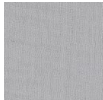
09959.022 LIGHT GREY