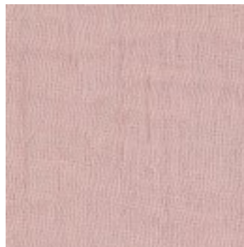
09959.015 SOFT ROSE