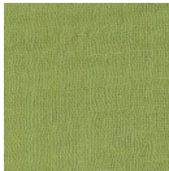
09959.064 OLD LIME