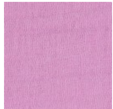
09959.065 LIGHT PINK