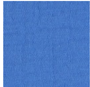
09959.077 ROYAL BLUE