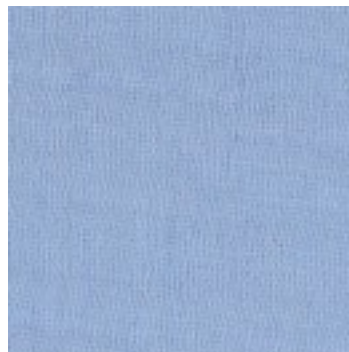
09959.055 LIGHT BLUE