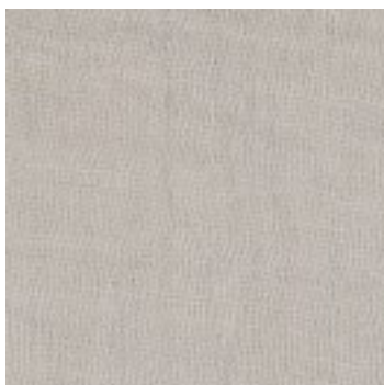
09959.045 LIGHT SAND