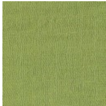
09959.064 OLD LIME