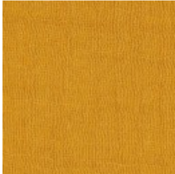
09959.023 DARK YELLOW