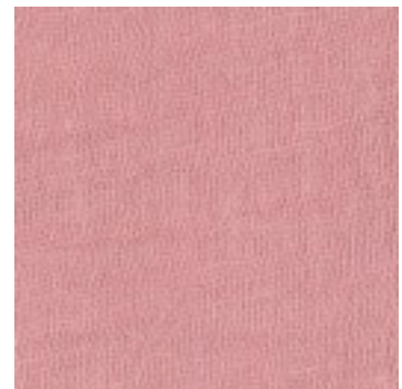
09959.007 OLD ROSE