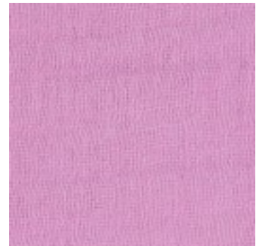
09959.065 LIGHT PINK