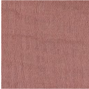
09959.048 OLD BLUSH