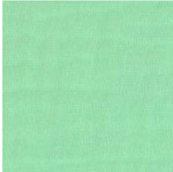
09959.072 LIGHT LIME