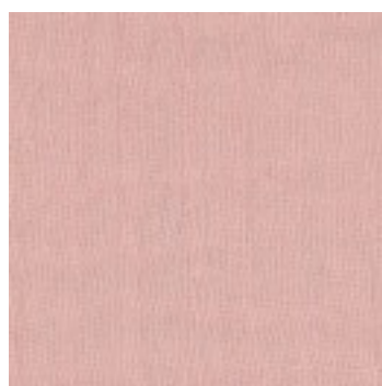
09959.021 LIGHT ROSE