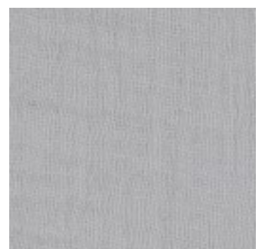
09959.022 LIGHT GREY