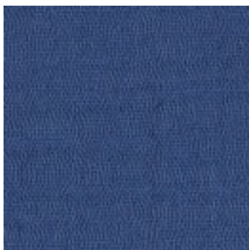
09959.078 MIDNIGHT BLUE