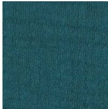
09959.052 DARK CYAN