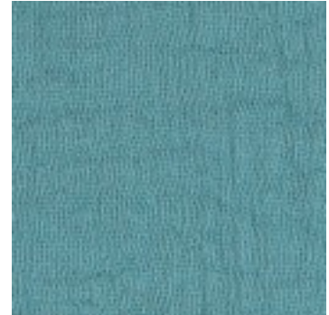
09959.038 BLUE SHADOW