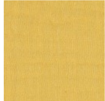
09959.026 SOFT YELLOW