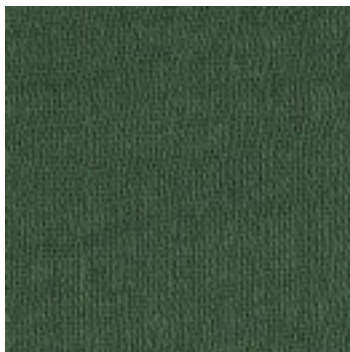
09959.042 DARK GREEN