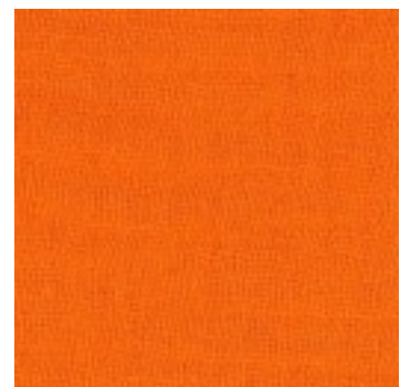
09959.071 ORANGE NEON