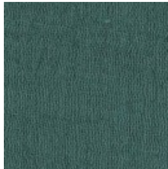
09959.040 OLD GREEN