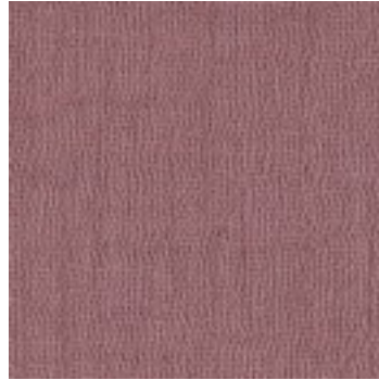
09959.049 LIGHT LILAC