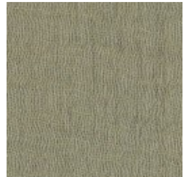
09959.041 MOSS GREEN