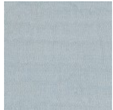
09959.053 BABY BLUE