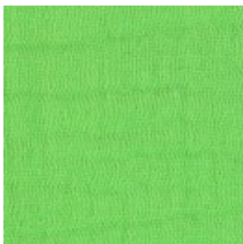
09959.069 LIME NEON