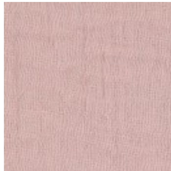
09959.015 SOFT ROSE