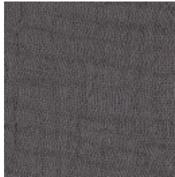
09959.002 DARK GREY