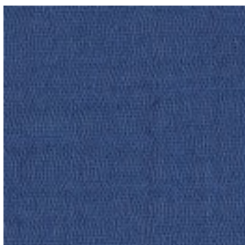
09959.078 MIDNIGHT BLUE