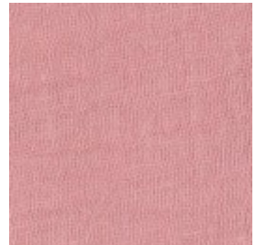
09959.007 OLD ROSE