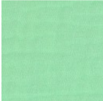
09959.072 LIGHT LIME