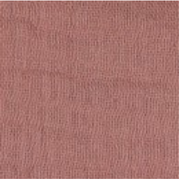
09959.048 OLD BLUSH