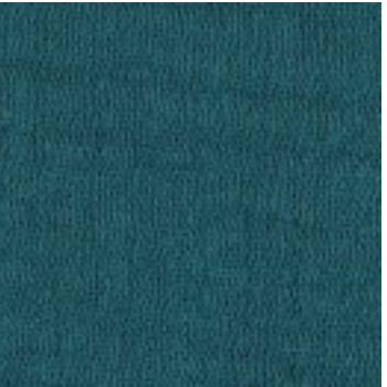
09959.052 DARK CYAN