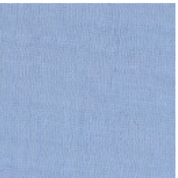
09959.055 LIGHT BLUE