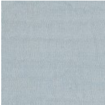
09959.053 BABY BLUE