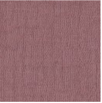
09959.049 LIGHT LILAC