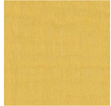
09959.026 SOFT YELLOW