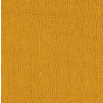
09959.023 DARK YELLOW