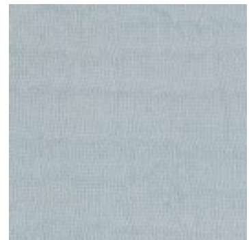
09959.053 BABY BLUE