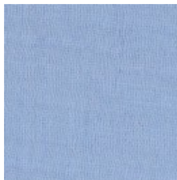
09959.055 LIGHT BLUE