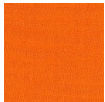
09959.071 ORANGE NEON