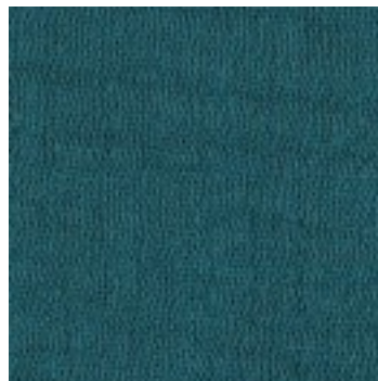
09959.052 DARK CYAN