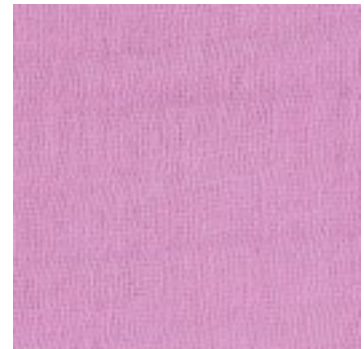
09959.065 LIGHT PINK