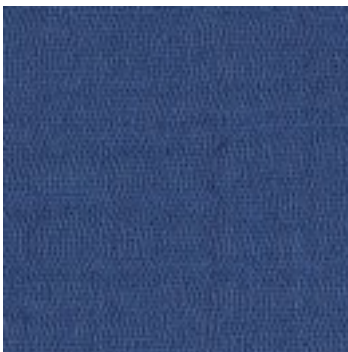
09959.078 MIDNIGHT BLUE