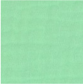
09959.072 LIGHT LIME