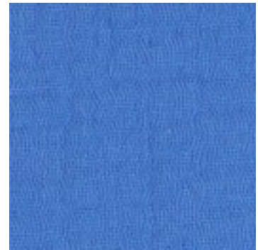
09959.077 ROYAL BLUE