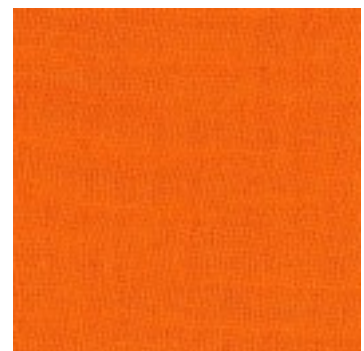
09959.071 ORANGE NEON