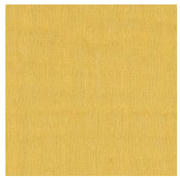
09959.026 SOFT YELLOW