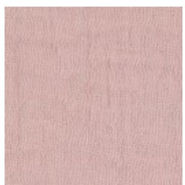
09959.015 SOFT ROSE