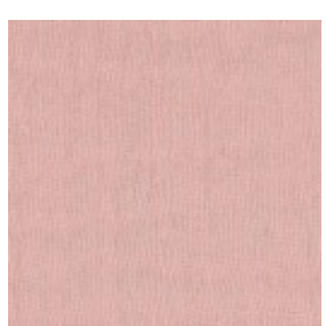
09959.021 LIGHT ROSE