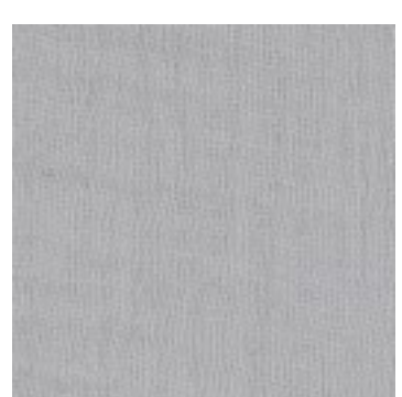
09959.022 LIGHT GREY