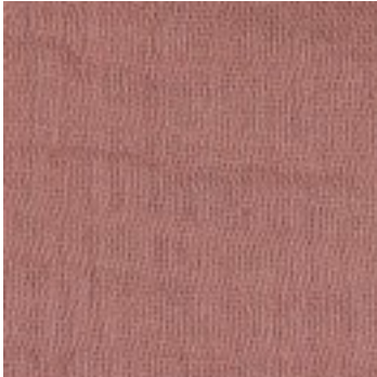
09959.048 OLD BLUSH