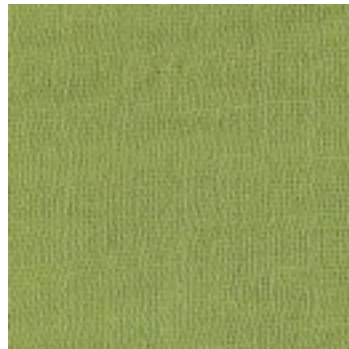
09959.064 OLD LIME