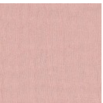
09959.021 LIGHT ROSE