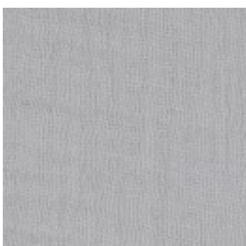
09959.022 LIGHT GREY