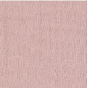
09959.015 SOFT ROSE