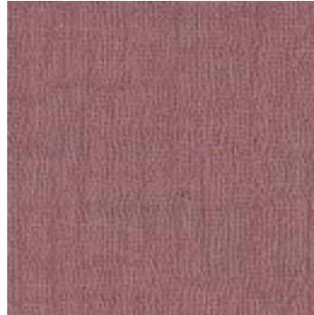
09959.049 LIGHT LILAC