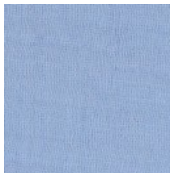
09959.055 LIGHT BLUE