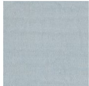
09959.053 BABY BLUE