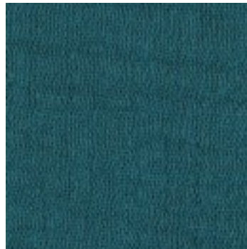
09959.052 DARK CYAN