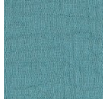
09959.038 BLUE SHADOW