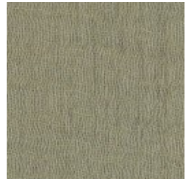
09959.041 MOSS GREEN