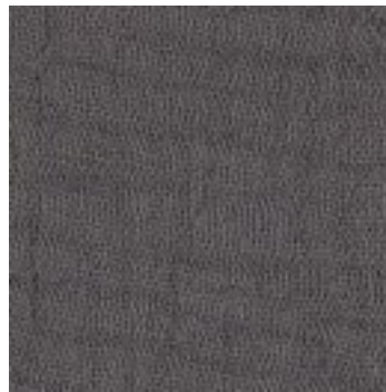
09959.002 DARK GREY