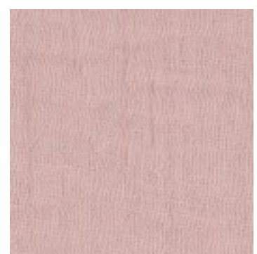
09959.015 SOFT ROSE