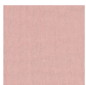
09959.021 LIGHT ROSE