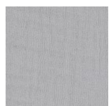
09959.022 LIGHT GREY