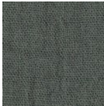
03959.002 DARK GREY