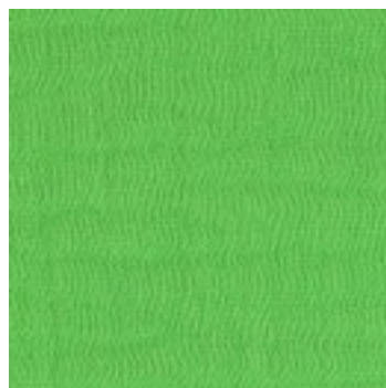
03959.069 LIME NEON