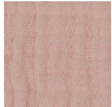
03959.007 OLD ROSE