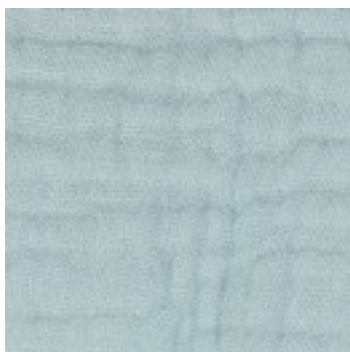
03959.053 BABY BLUE