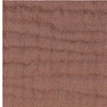
03959.048 OLD BLUSH