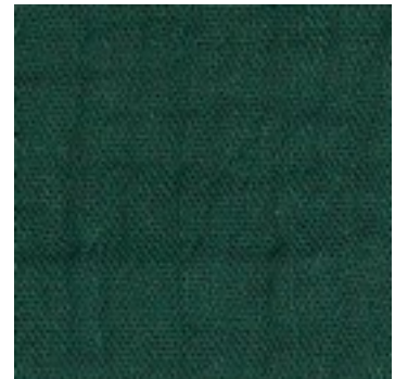
03959.040 OLD GREEN