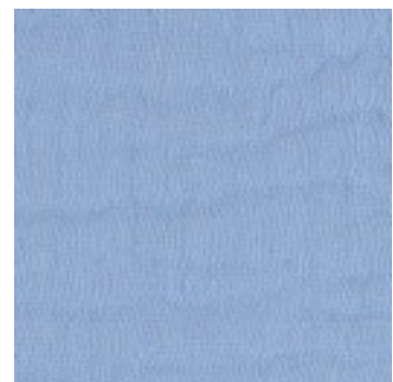
03959.055 LIGHT BLUE