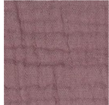
03959.049 LIGHT LILAC