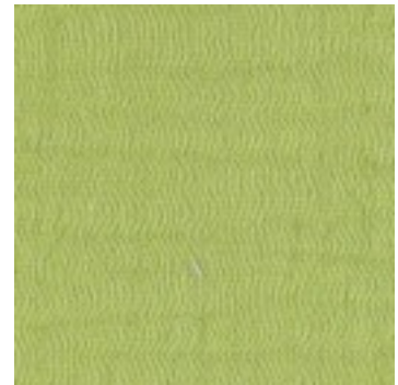
03959.064 OLD LIME