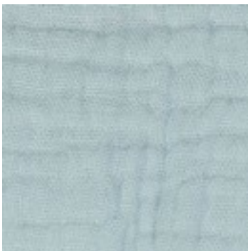
03959.053 BABY BLUE