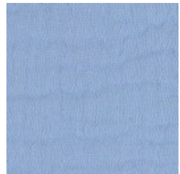
03959.055 LIGHT BLUE