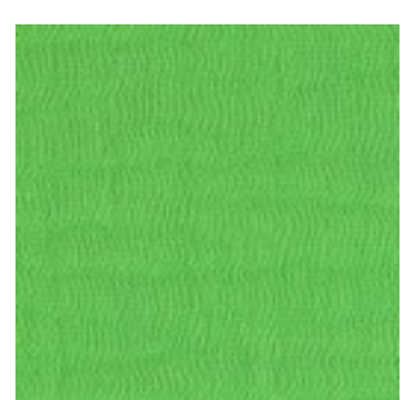
03959.069 LIME NEON