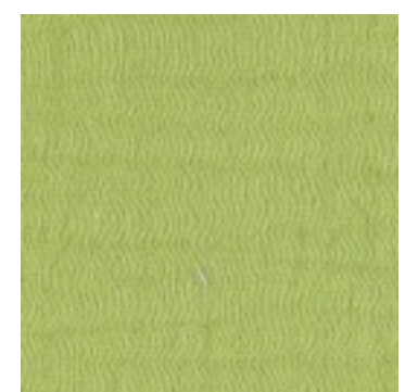
03959.064 OLD LIME