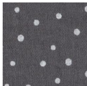
04671.022 DARK GREY