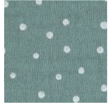
04671.025 OLD GREEN