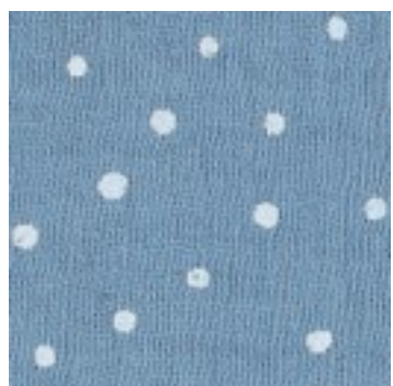
04671.020 LIGHT BLUE