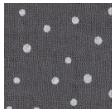
04671.022 DARK GREY