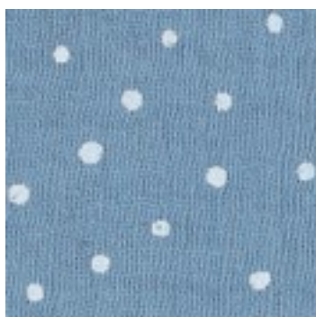
04671.020 LIGHT BLUE