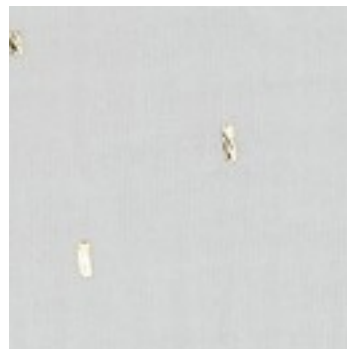
07261.006 OFF WHITE/GOLD