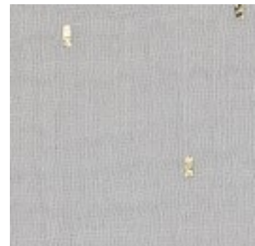
07261.007 LIGHT GREY/GOLD