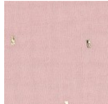
07261.003 LIGHT ROSE/GOLD