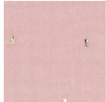
07261.003 LIGHT ROSE/GOLD