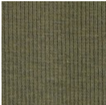
08492.034 ARMY GREEN