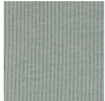
08492.036 OLD GREEN