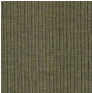
08492.034 ARMY GREEN