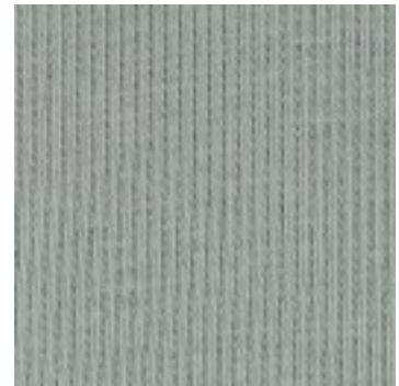
08492.036 OLD GREEN