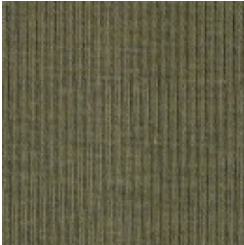
08492.034 ARMY GREEN