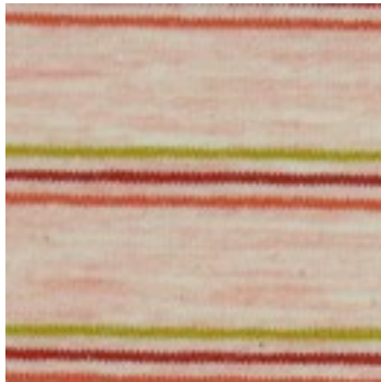
08886.004 ROSE MELANGE