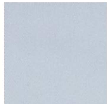
08008.018 LIGHT BLUE