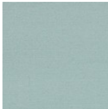
08540.008 LIGHT AQUA