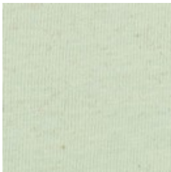
08534.014 LIGHT MINT