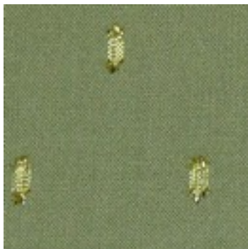
08516.004 MOSS GREEN