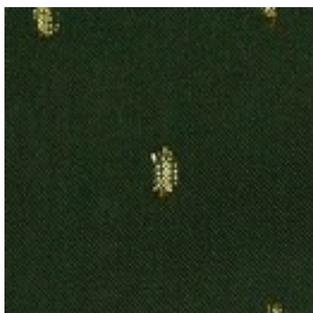
08516.008 DARK GREEN