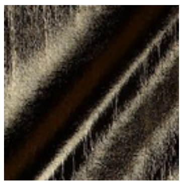
05190.001 LIGHT GOLD