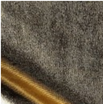
05190.001 LIGHT GOLD