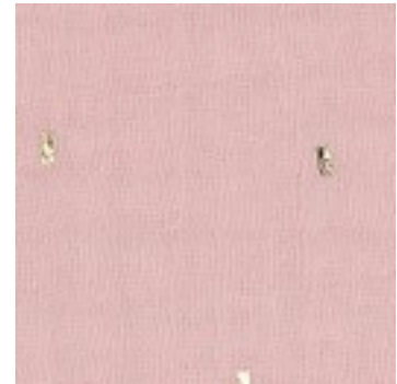
07261.003 LIGHT ROSE/GOLD