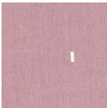
07261.008 OLD ROSE/GOLD