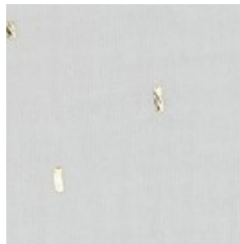
07261.006 OFF WHITE/GOLD