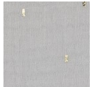
07261.007 LIGHT GREY/GOLD