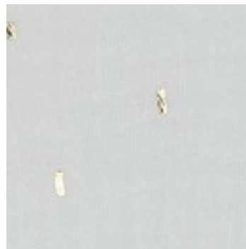
07261.006 OFF WHITE/GOLD