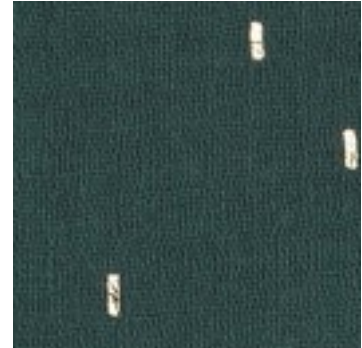
07261.015 DARK GREEN/GOLD