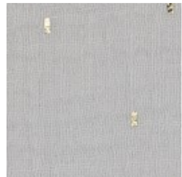
07261.007 LIGHT GREY/GOLD