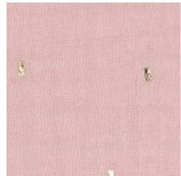
07261.003 LIGHT ROSE/GOLD