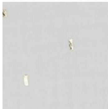
07261.006 OFF WHITE/GOLD