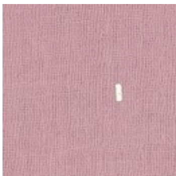
07261.008 OLD ROSE/GOLD