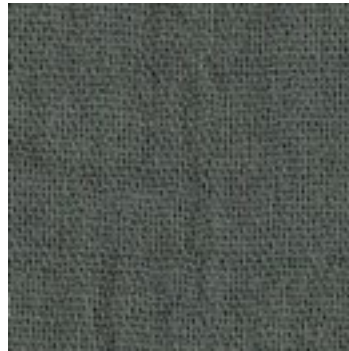
03959.002 DARK GREY