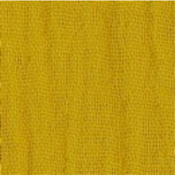
03959.023 DARK YELLOW