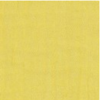
03959.026 SOFT YELLOW