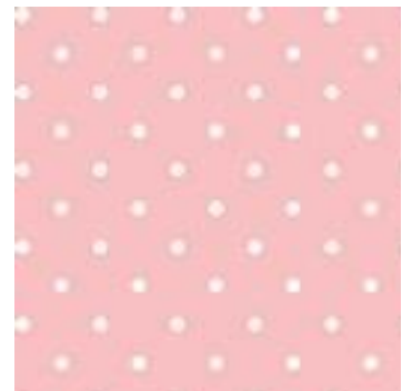
C4948.012 OLD ROSE