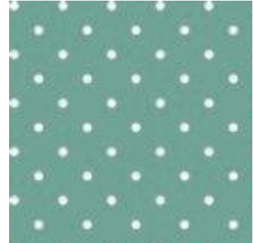
C4948.029 OLD GREEN