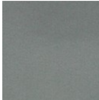
08008.003 LIGHT GREY