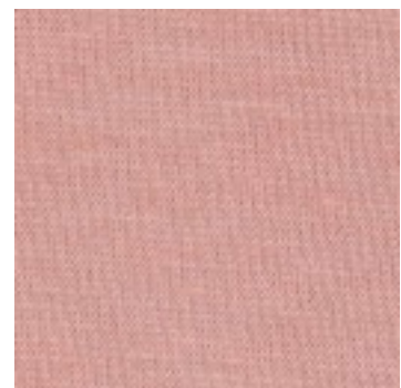
07920.013 OLD ROSE