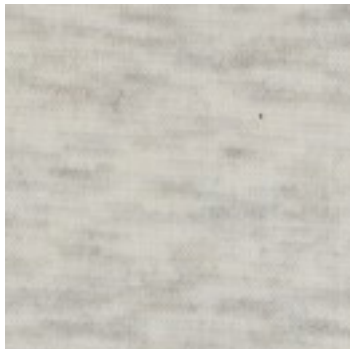
07920.019 ECRU MELANGE