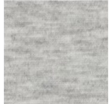
07920.018 LIGHT GREY MELANGE