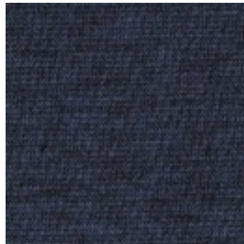
07920.021 INDIGO MELANGE