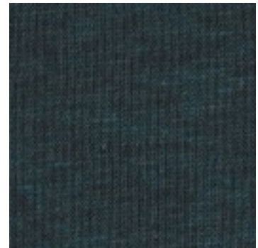
07920.022 DARK CYAN