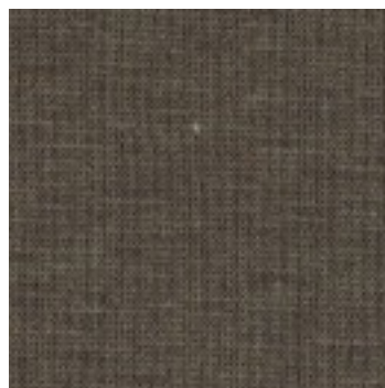
07920.025 MOSS GREEN