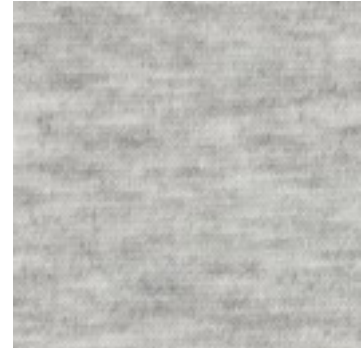
07920.018 LIGHT GREY MELANGE