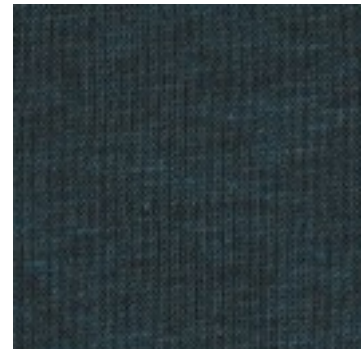
07920.022 DARK CYAN