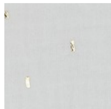
07261.006 OFF WHITE/GOLD