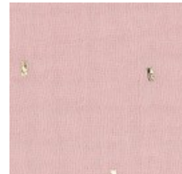
07261.003 LIGHT ROSE/GOLD