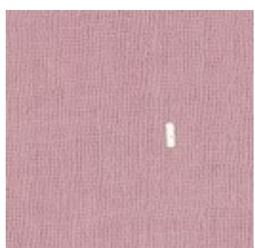
07261.008 OLD ROSE/GOLD