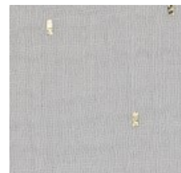
07261.007 LIGHT GREY/GOLD