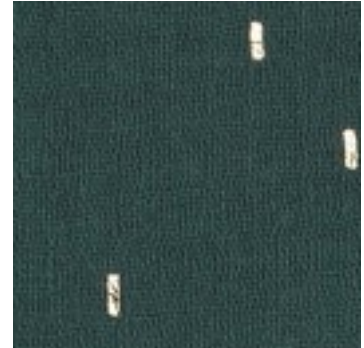
07261.015 DARK GREEN/GOLD