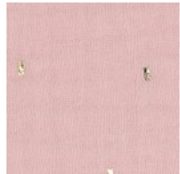
07261.003 LIGHT ROSE/GOLD