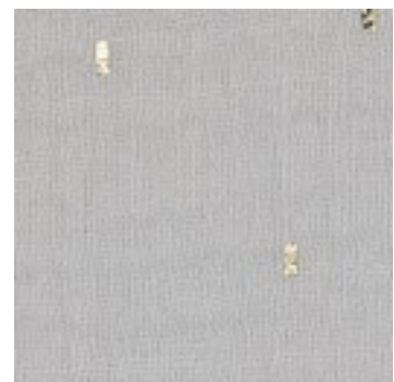
07261.007 LIGHT GREY/GOLD