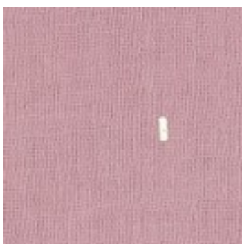
07261.008 OLD ROSE/GOLD