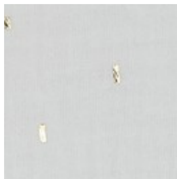
07261.006 OFF WHITE/GOLD