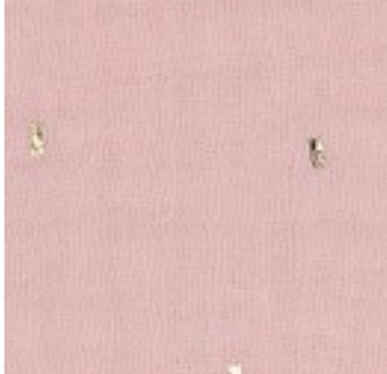
07261.003 LIGHT ROSE/GOLD