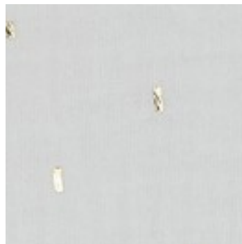
07261.006 OFF WHITE/GOLD