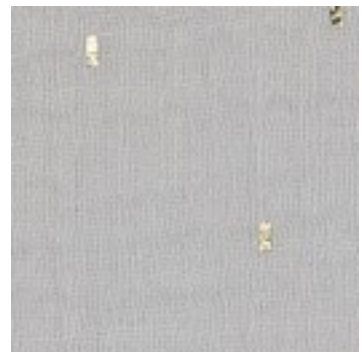
07261.007 LIGHT GREY/GOLD