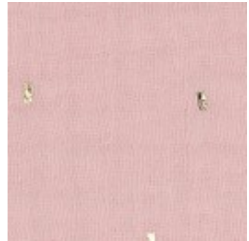
07261.003 LIGHT ROSE/GOLD