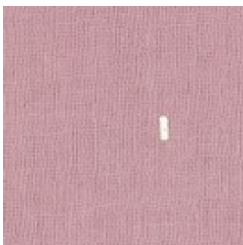
07261.008 OLD ROSE/GOLD