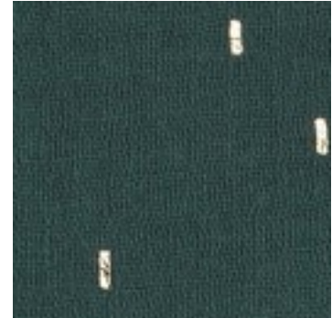
07261.015 DARK GREEN/GOLD