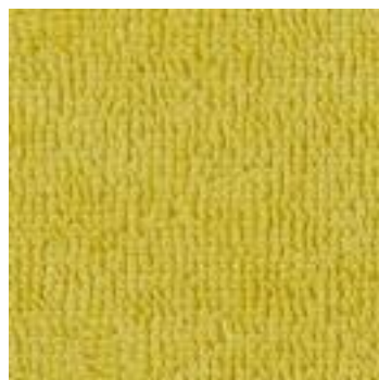
02551.016 LIGHT YELLOW